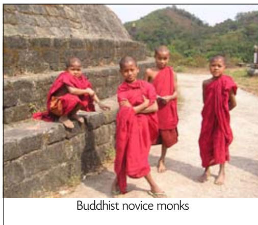
Buddhist novice monks

In Myanmar, out of a population of 48 million, there are an estimated