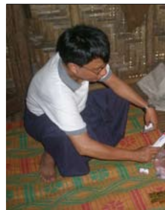
A home visit in Kachin