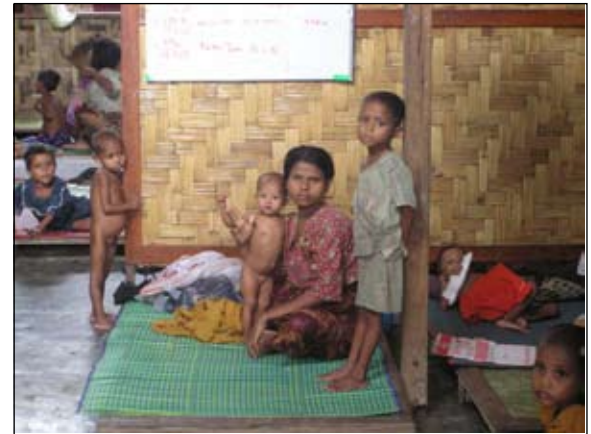
A feeding centre in Rakhine

To travel to any of the clinics outside Yangon, all the expats had to