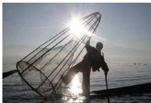
A Fisherman on the Inle Lake

The delta area, which was most seriously affected by cyclone Nargis, was not an area where we were working but, with a huge national staff team and already having logistics on the ground, MSF were able to move into the delta region and provide emergency care quite quickly. I was so relieved to hear that none of our staff had been hurt, but many had damage to their homes and our patients in Yangon who live in very poor conditions simply had their homes swept away. Now the media has moved its attention elsewhere but there are many more people needing assistance with food, shelter, clean water and medical aid and the emergency teams are continuing to run clinics for MSF in the area.